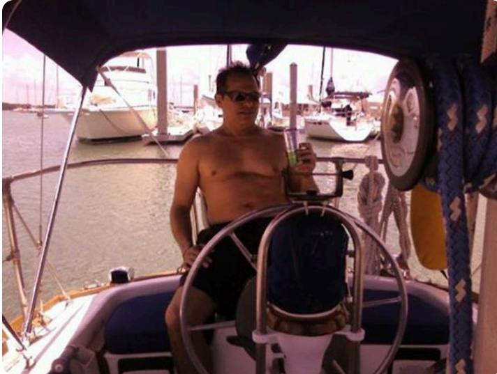
Terry's Boat 2007